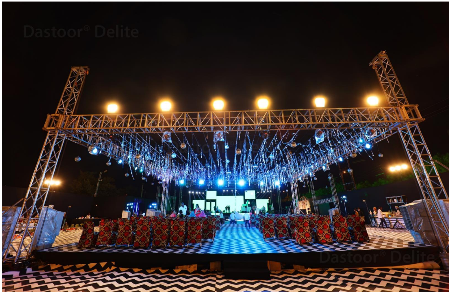
Royal Baraat Entrance