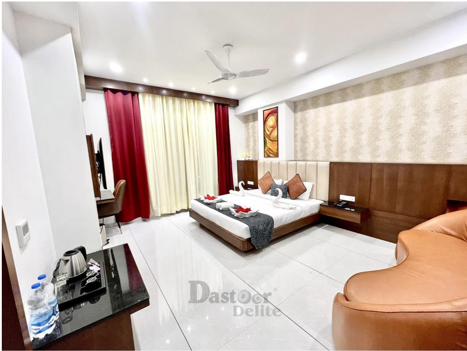
Bride/Groom Suite Room