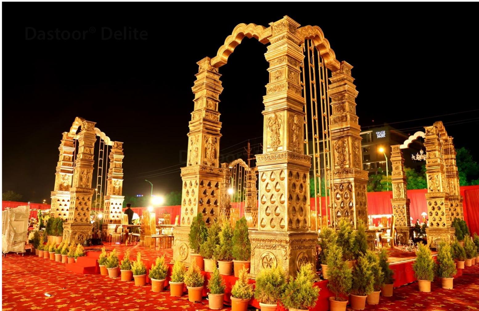
The Grand Reception