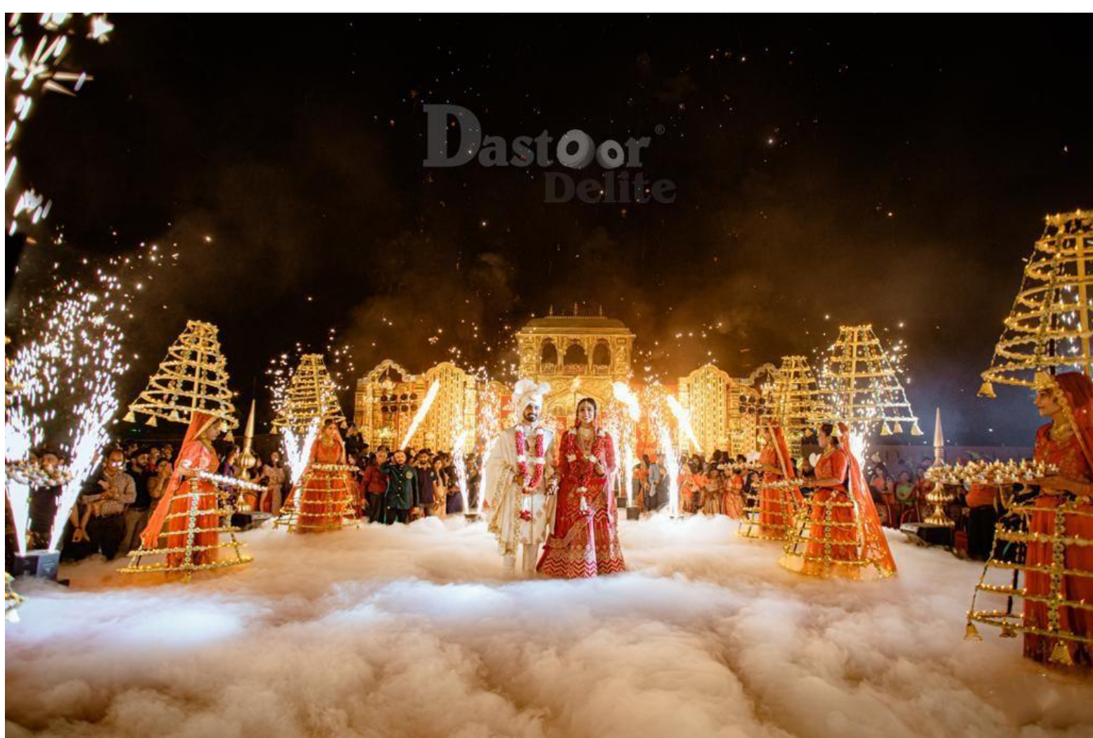
Grand Sangeet / Cocktail Truss Stage