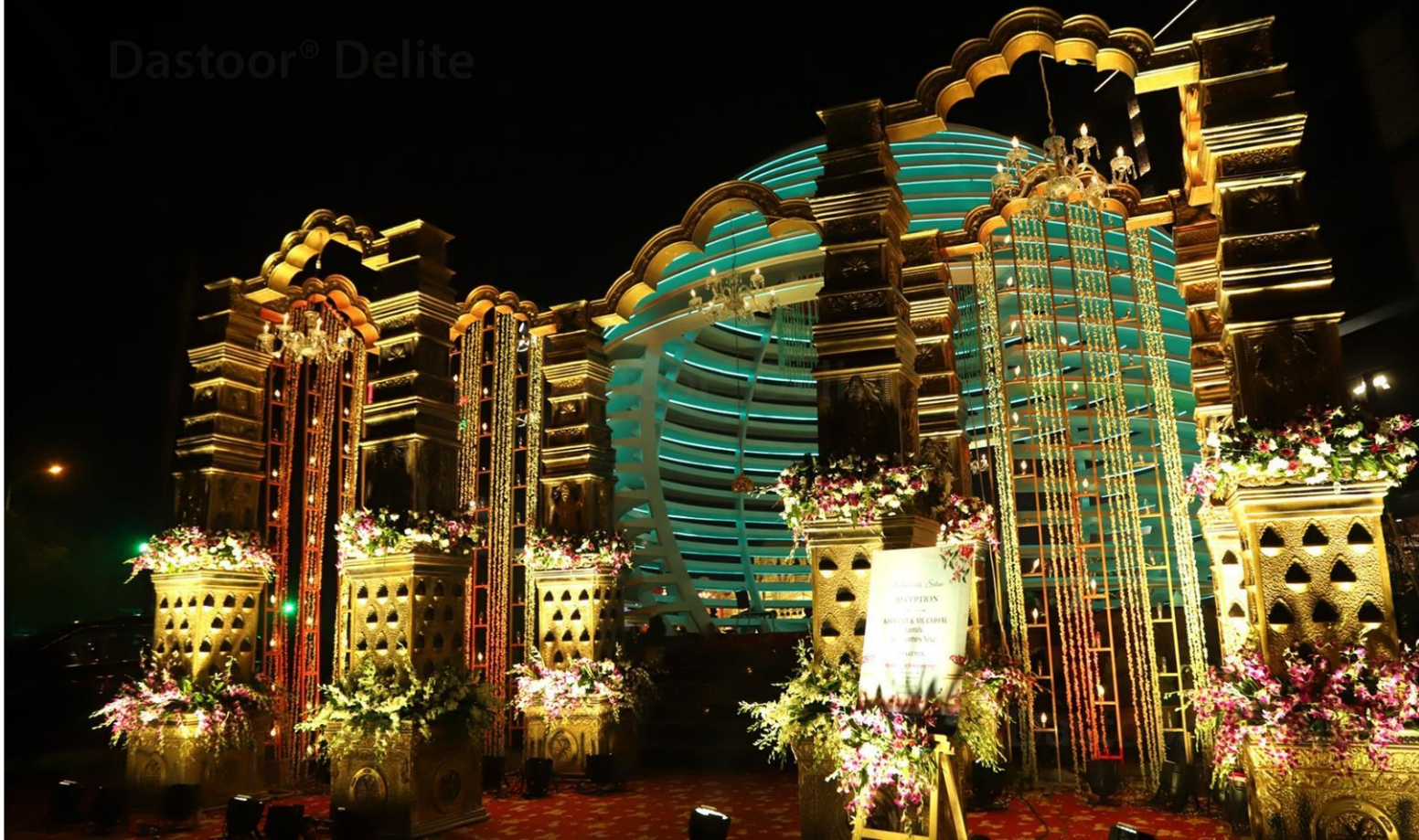
The Palatial Stage